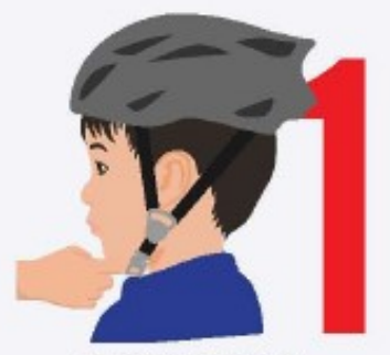
1 FINGER SPACE UNDER YOUR CHIN

SHAKE, SHAKE, SHAKE your head up and down and side to side to make sure the helmet is snug!